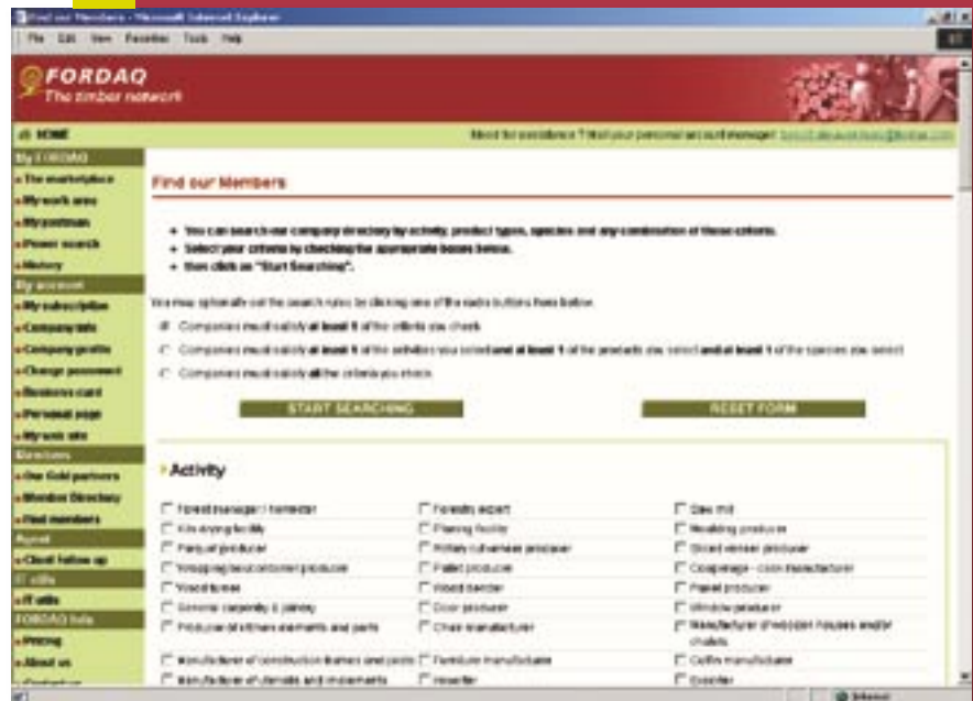
The advanced member search